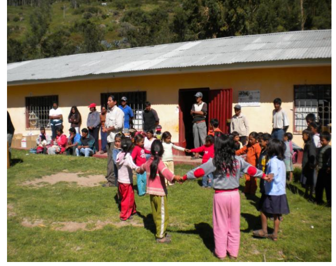
School in Urubamba, Peru where delegates brought breakfast and gifts for the students