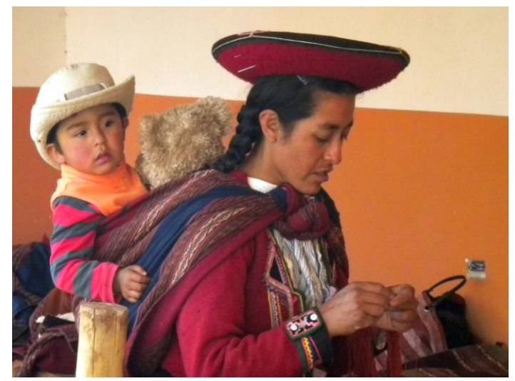
Peruvian mother, child and teddy bear