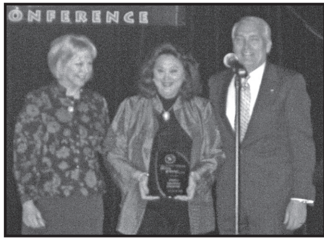
Arizona Chapter Receives Award at PTPI World Conference in Sydney, Australia