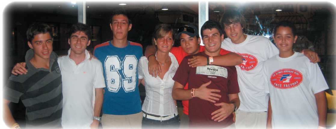
Italian and American Teens at FX Raceway