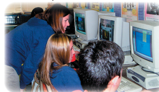
PTPI School & Classroom Program in Flagstaff